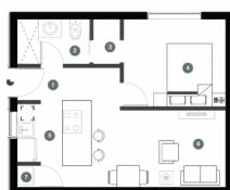
JADE - 1 BED