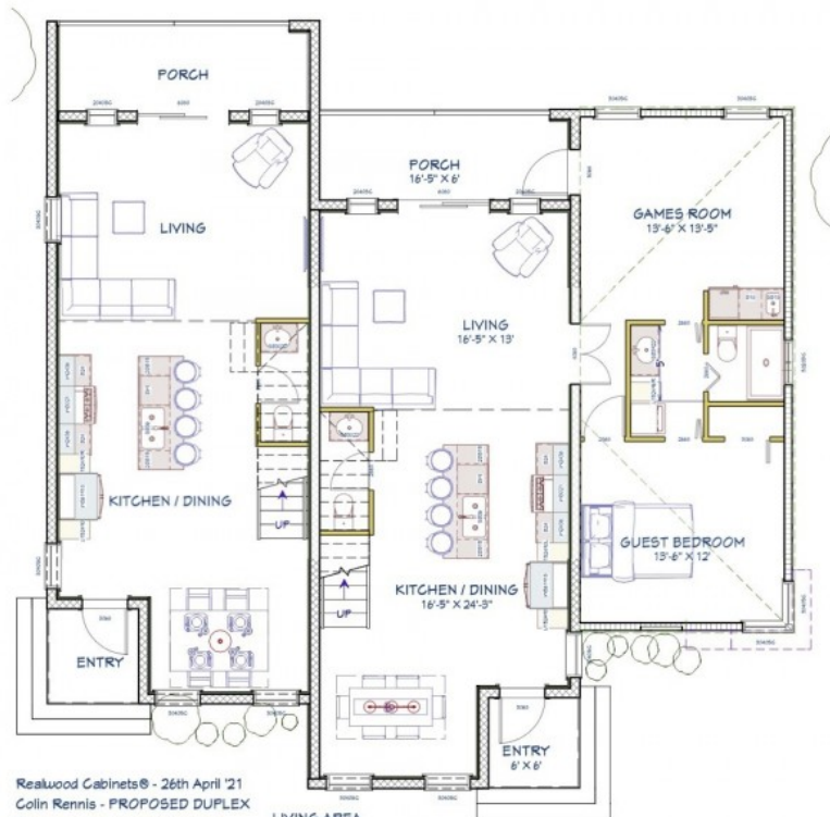
Realwood Cabinets® - 26th April '21 Colin Rennis - PROPOSED DUPLEX Passion Circle Lookout Gardens, Bodden Town, Grand Cayman