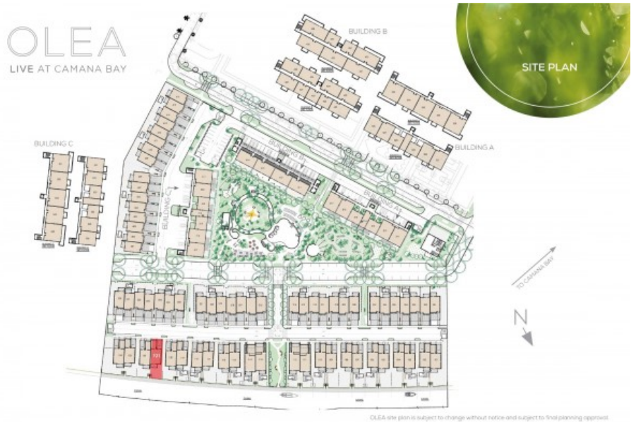
OLEA site plan is subject to change without notice and subject to final planning approval.