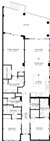
Seacrest Residences 2

GROSS INTERNAL AREA FLOOR 1: 1,588 SQ. FT. TOTAL: 1,588 SQ. FT.